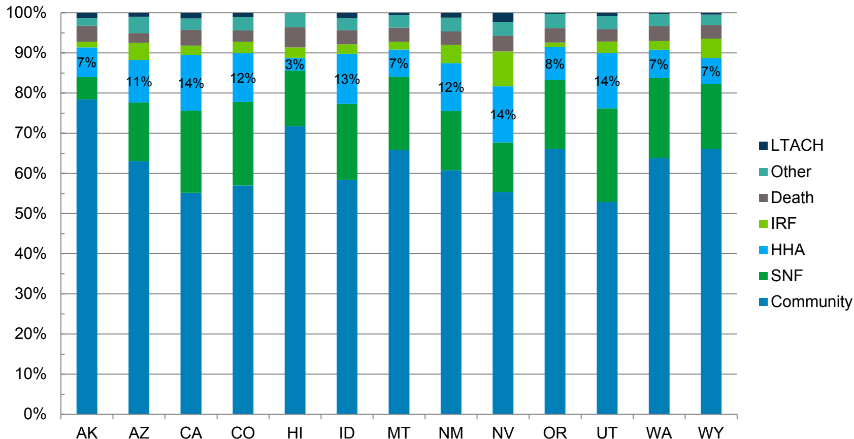
Chart 3.7: Initial Patient Destinations Following an Inpatient Hospital Stay for Medicare Beneficiaries in 2013, for States in Western Region